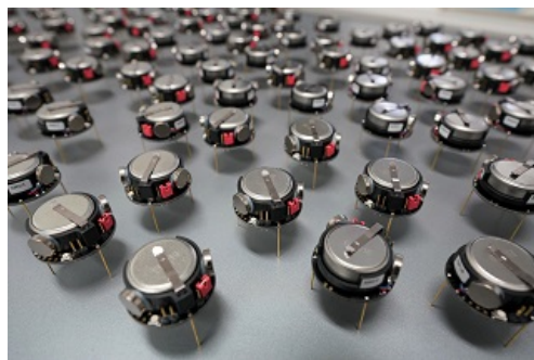
Experiments with 100 kilobots